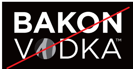
Do not reverse 1-color grayscale logo.