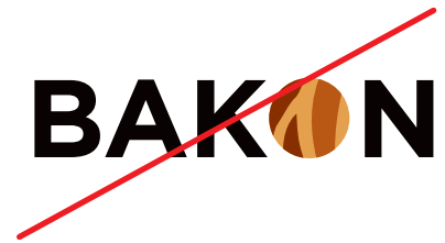
Do not alter logo.