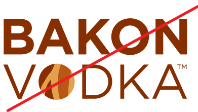
Logo type must be in black or white.